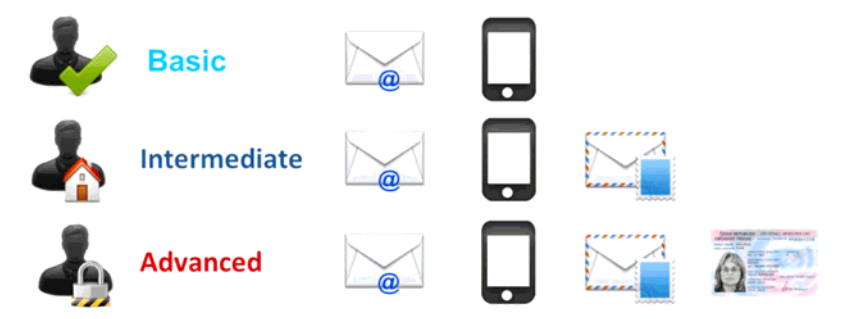
Graphic 1: mojeID Levels of Trust